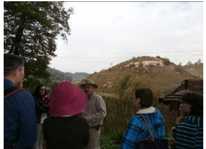
11. Rock layers are massive with clay between. Core drilling indicates two substantial concrete layers beneath and three meters of air space between, suggesting a chamber.