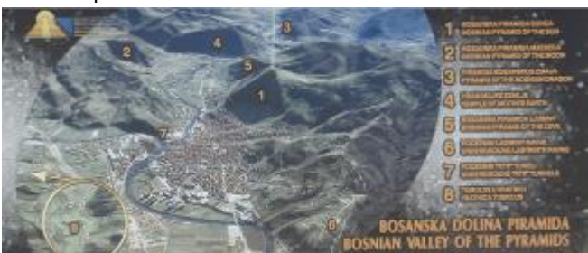
15. This poster shows the general site layout. We entered the labyrinth at location 6. We have visited the tumulus at 8. Next, we shall go to the Pyramid of the Sun at location 1.