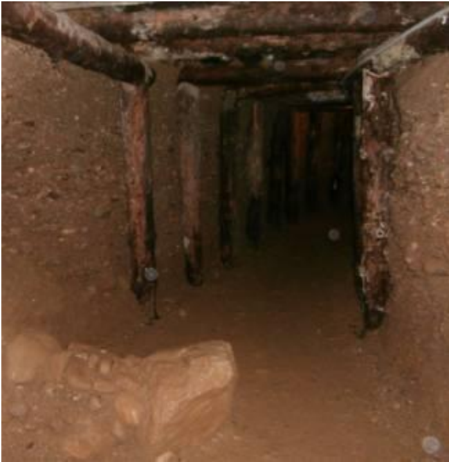
6. Further into the tunnel and more energy orbs.