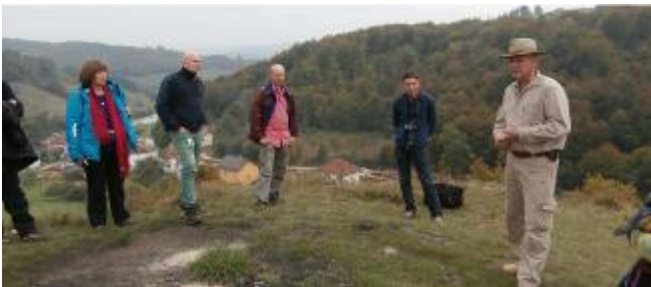
14. On top of the Vratnica Tumulus.