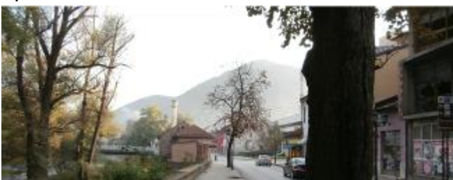
16. There it is and we shall walk from this street to the top.