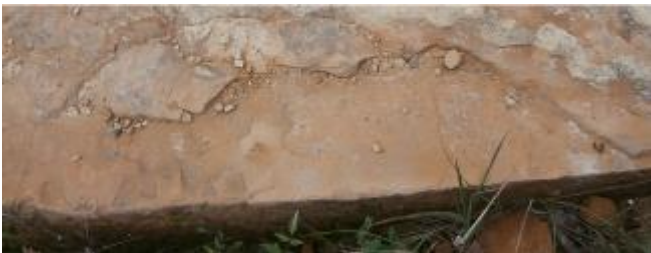
13. A curious feature is that 3-4 cm of a different rock has been fused onto the upper surface of the rock layers. The photo shows where the layer has been chipped away,