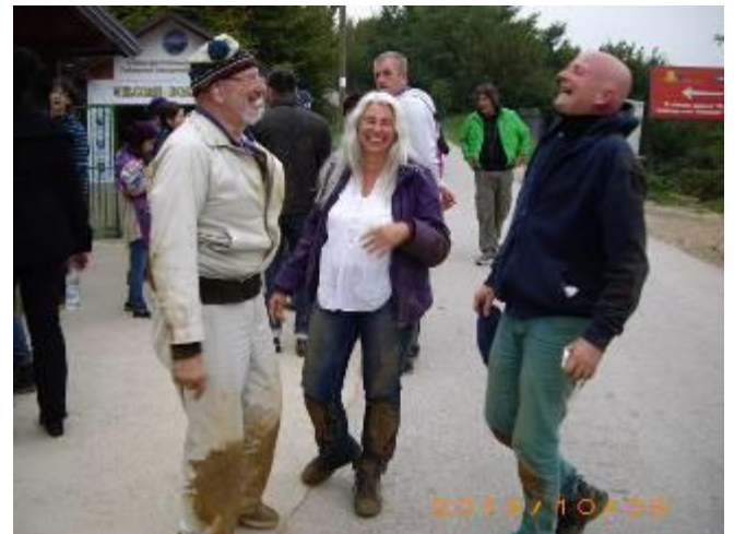
10. Must get fresh trousers before dining at the hotel! Moving on to Vratnica Tumulus—this is of layered construction, as is Silbury Hill, and a little higher: