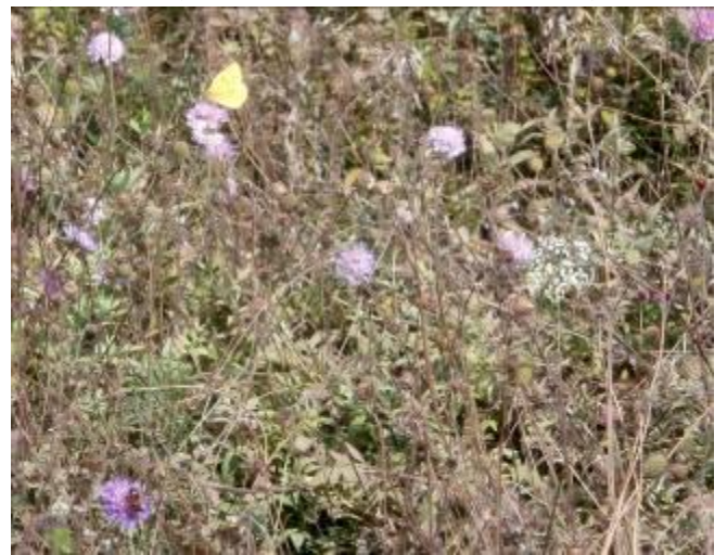
18. At the top—bees, butterflies and flowering scabious.