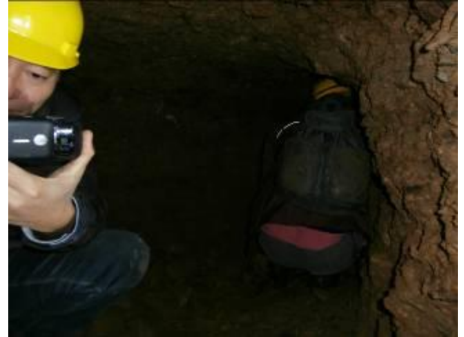
9. We got wet and dirty in dark, part-excavated tunnels.

and drinkable. A standardised dowsing procedure is used for obtaining biophotonic values. The measurements indicate that at some locations the spiritual energy values are very high compared to, for example, a Tibetan temple.