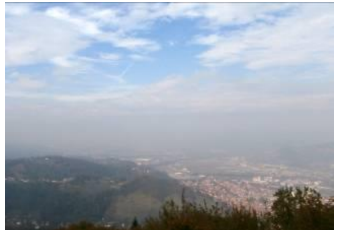
19. To the north is the town of Visoko where our trek began. We could have taken a taxi as far as the café!