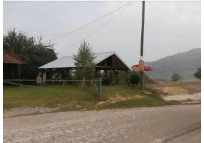
17. A winding road brings us to Sanela's café and welcome respite within just a few hundred meters of the apex.