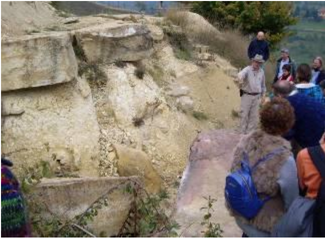
12. Some layered rock slabs weigh up to 20-tons.