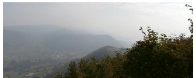
20. To the south are the structures named 'Pyramid of the Love' and the 'Temple of Mother Earth'