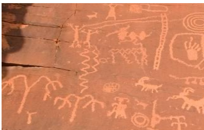
Atlatl Rock Petro-glyphs: Two beings depicted with three-fingered hands. (Other detail relates to their birth sequence on 'Crogaria' ... their name for their home planet.